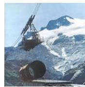
Material cable car, CH