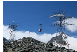
Klein Matterhorn, CH