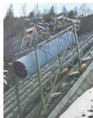
Special cable car Brusio, CH