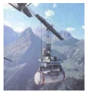
Cement transport cable car Baden, CH