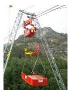
Material cable car Jungbach, CH